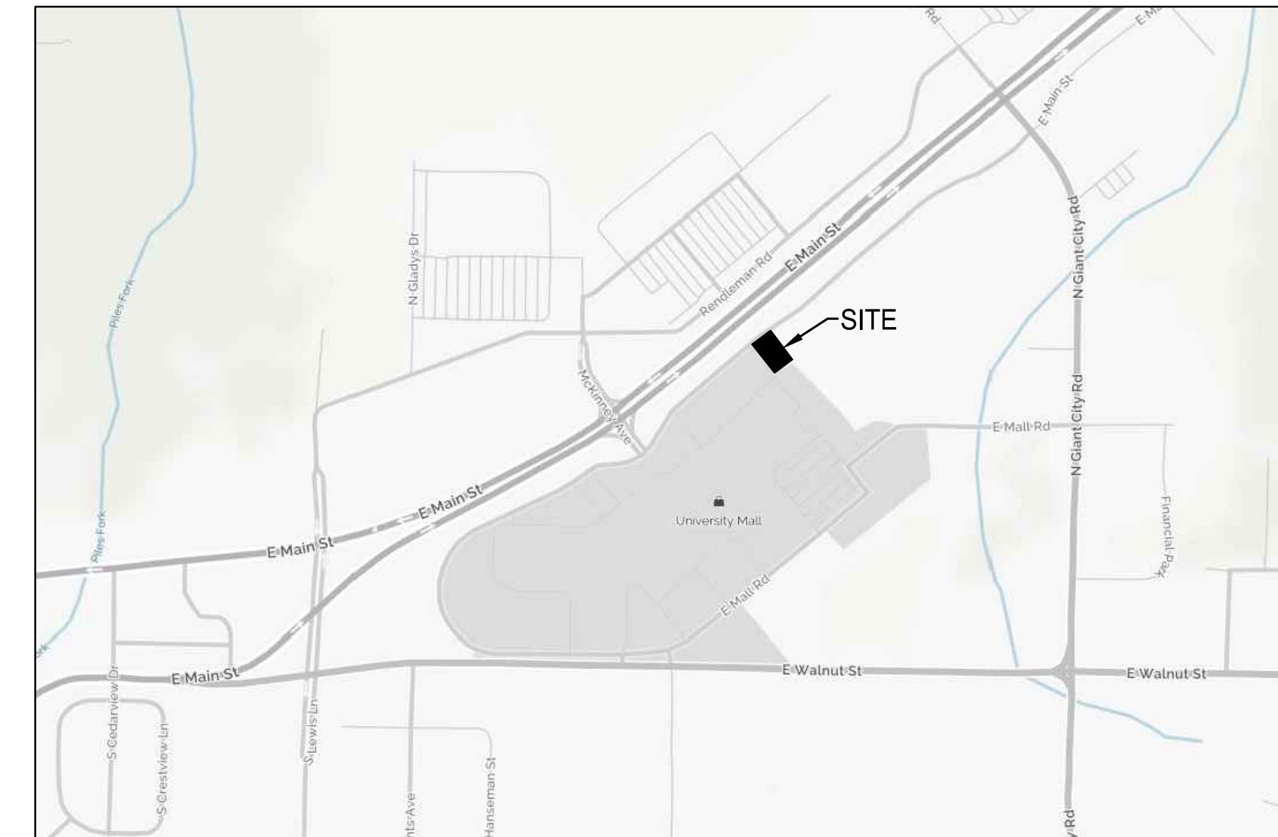
VICINITY MAP N.T.S.

PROPOSED DEVELOPMENT 1275 E. MAIN STREET CARBONDALE, IL