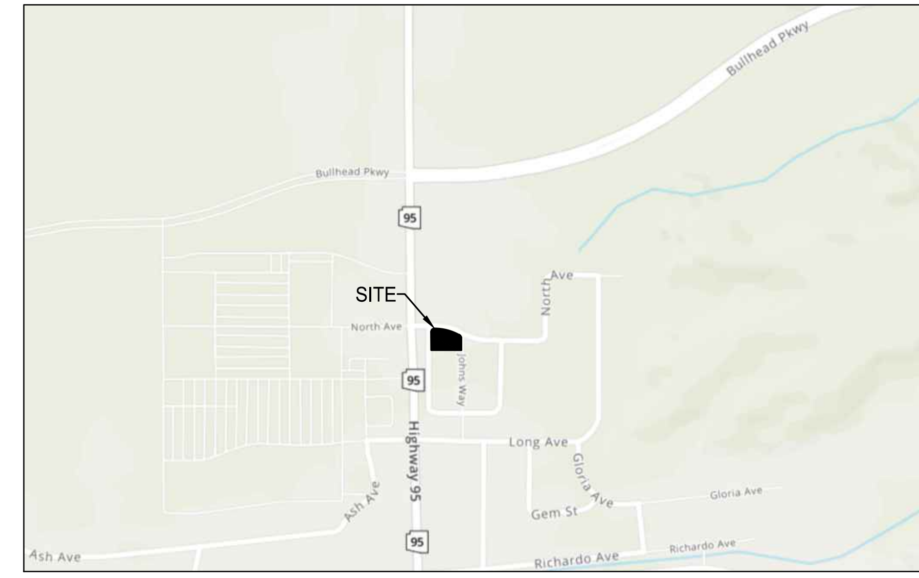
VICINITY MAP N.T.S.